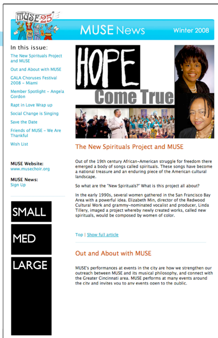
MUSE News Advertising